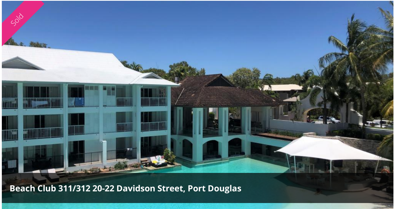
Beach Club 311/312 20-22 Davidson Street, Port Douglas