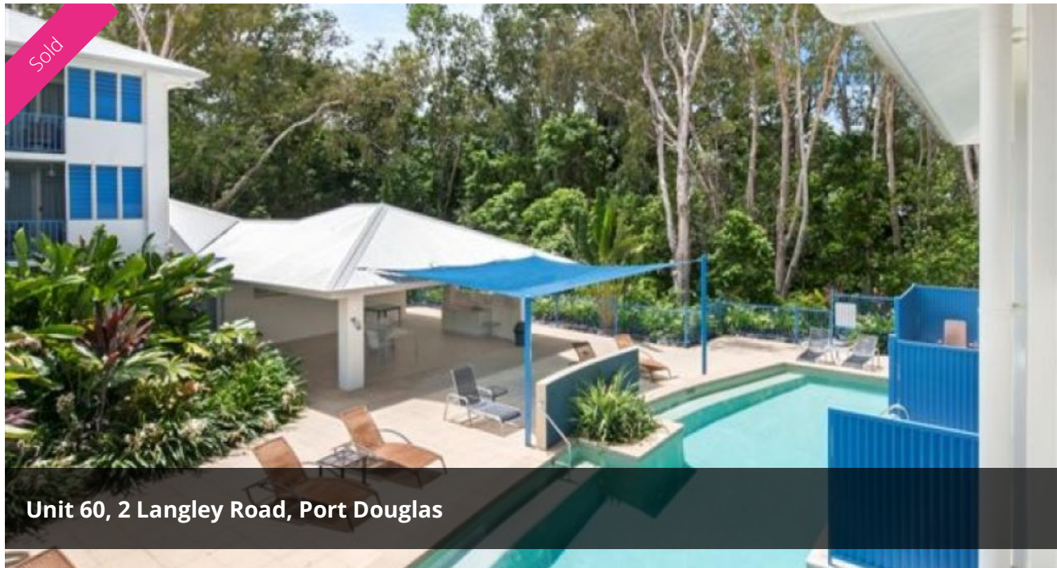
Unit 60, 2 Langley Road, Port Douglas