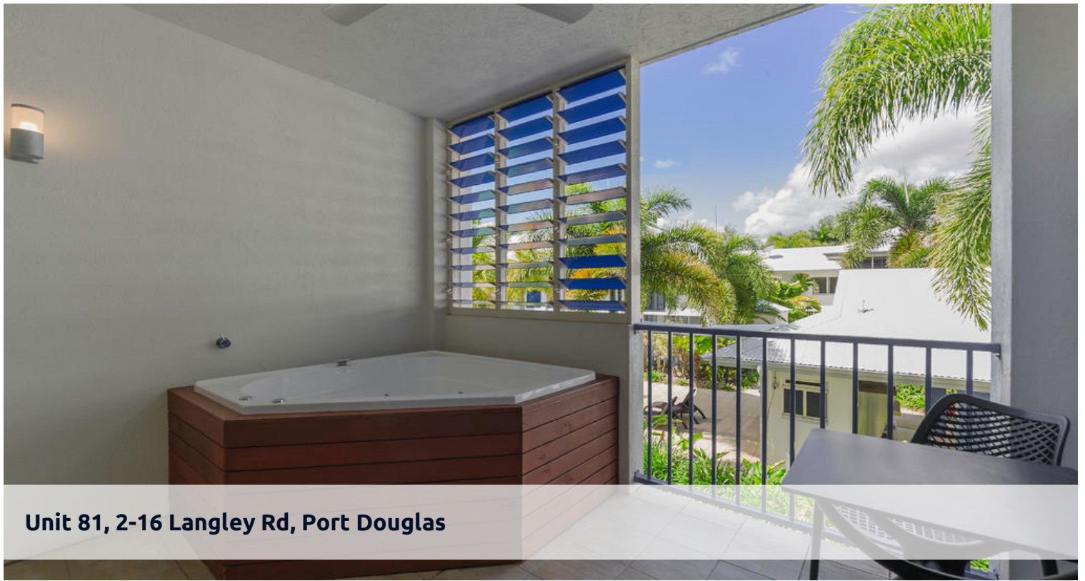
Unit 81, 2-16 Langley Rd, Port Douglas