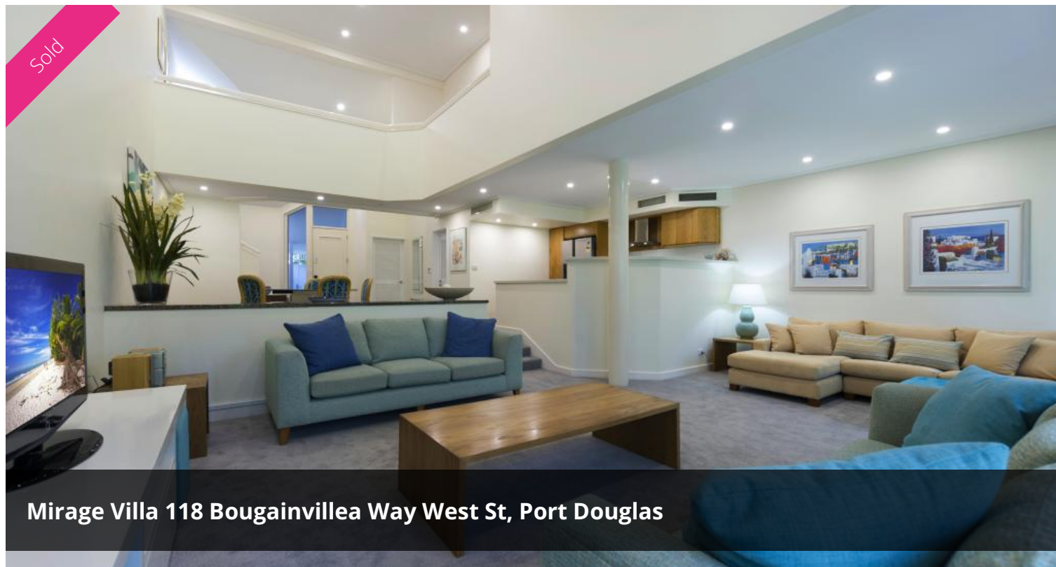
Mirage Villa 118 Bougainvillea Way West St, Port Douglas