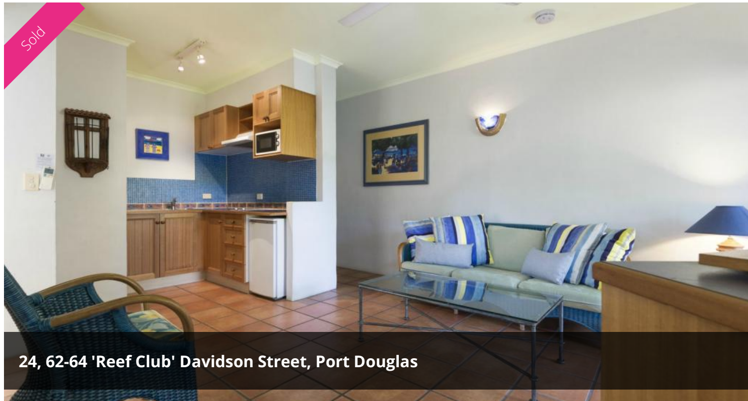
24, 62-64 'Reef Club' Davidson Street, Port Douglas