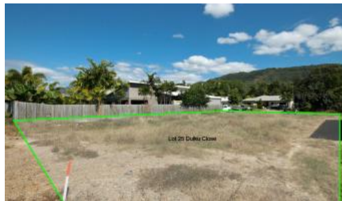
Lot 25 Dulku Close