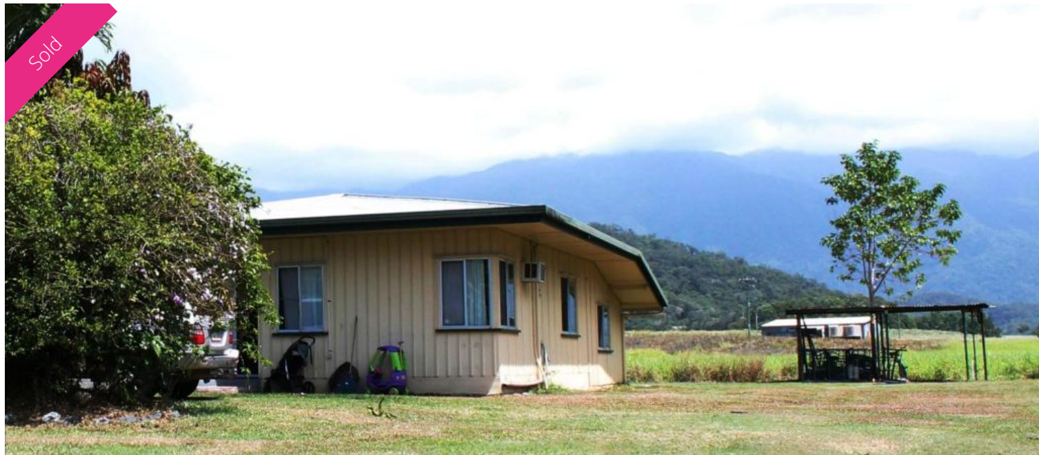
Lot 10 Miallo Bamboo Creek Rd St, Miallo