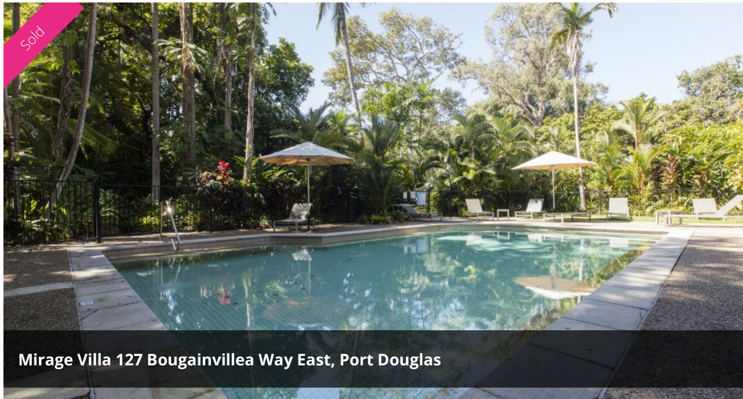
Mirage Villa 127 Bougainvillea Way East, Port Douglas