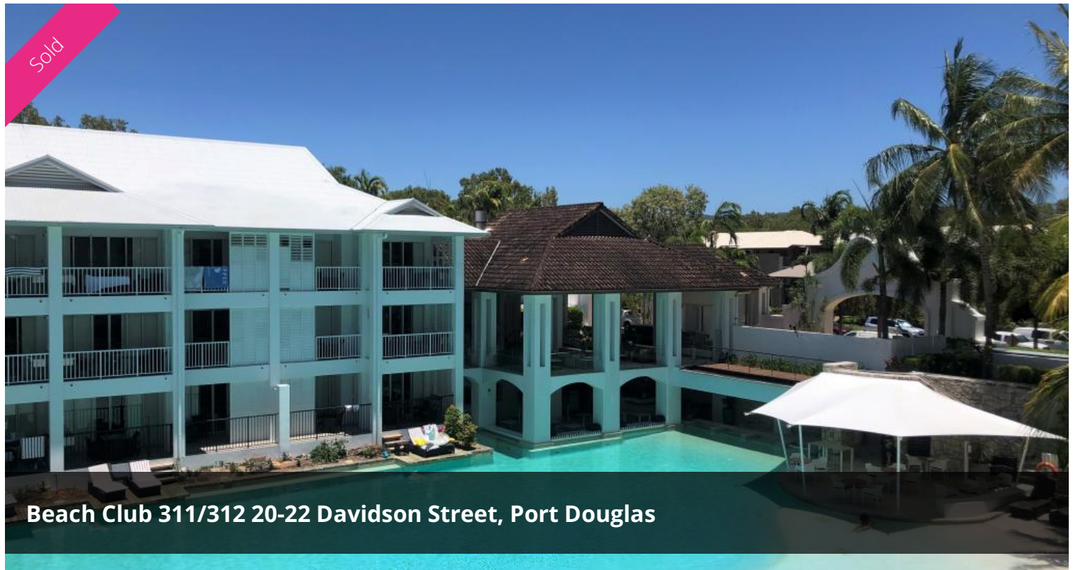
Beach Club 311/312 20-22 Davidson Street, Port Douglas