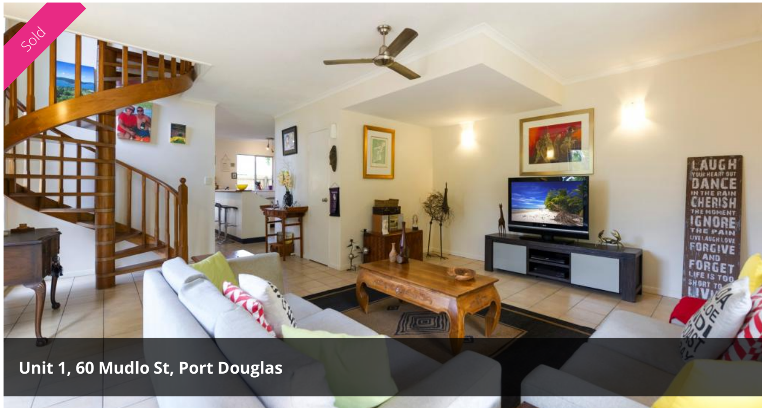
Unit 1, 60 Mudlo St, Port Douglas