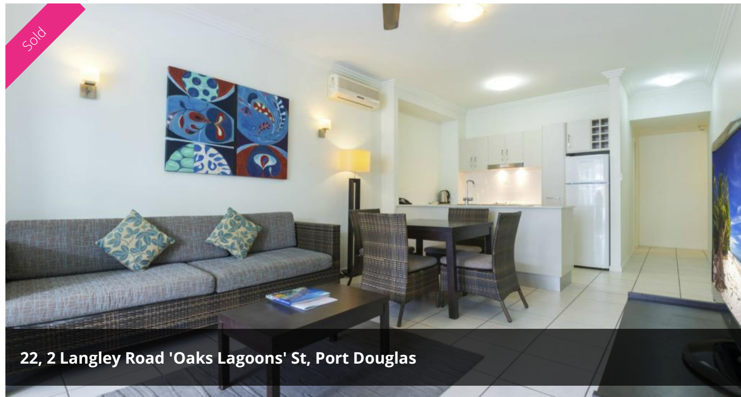
22, 2 Langley Road 'Oaks Lagoons' St, Port Douglas