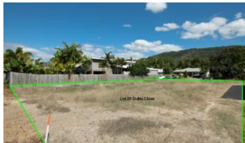
Lot 25 Dulku Close